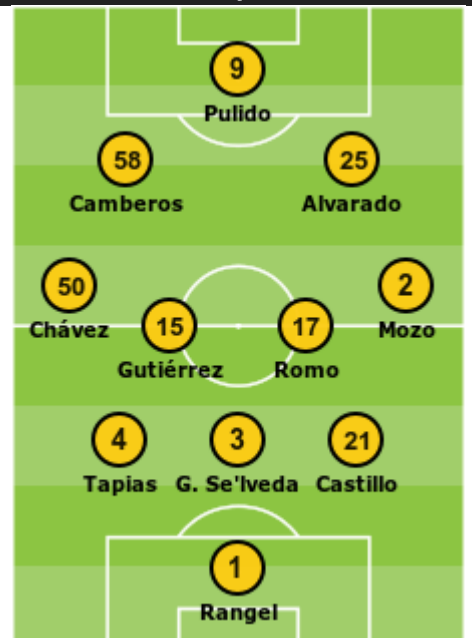
Guadalajara - Club América (3/6/2025 1-0)