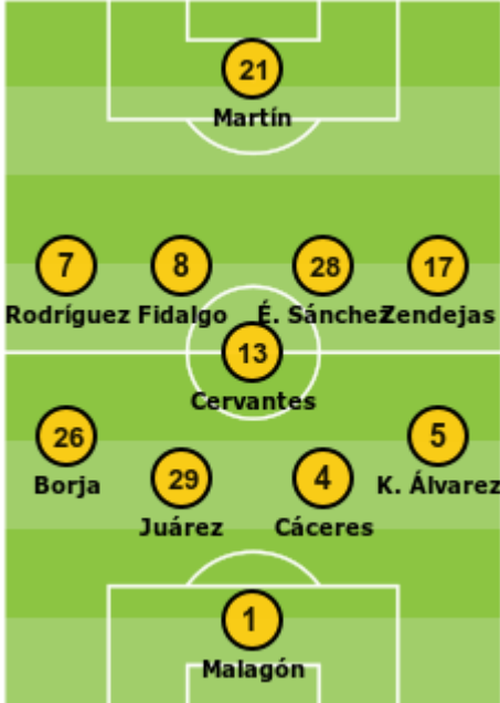
Guadalajara - Club América (3/6/2025 1-0)