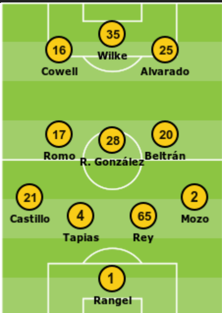
Cibao - Guadalajara (2/7/2025 1-1)