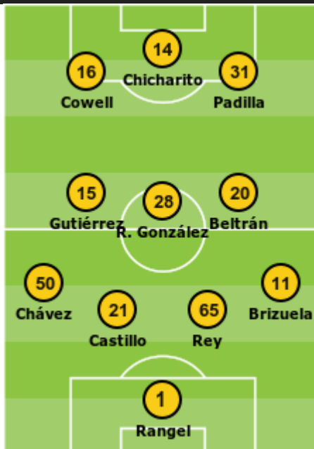
Guadalajara - Cibao (2/13/2025 3-0)

Subs: 45. Romo for Gutiérrez, 64. Armando González for Chicharito; Camberos for Padilla, 70. Zamora for Cowell, 82. Martínez for Castillo