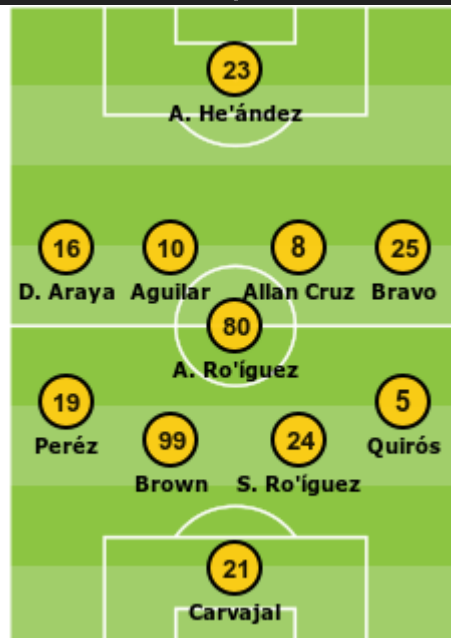
Real Salt Lake - Herediano (2/27/2025 1-2)