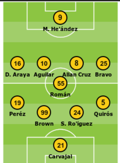
Herediano - LA Galaxy (3/6/2025 1-0)