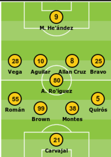
Herediano - Real Salt Lake (2/19/2025 0-0)