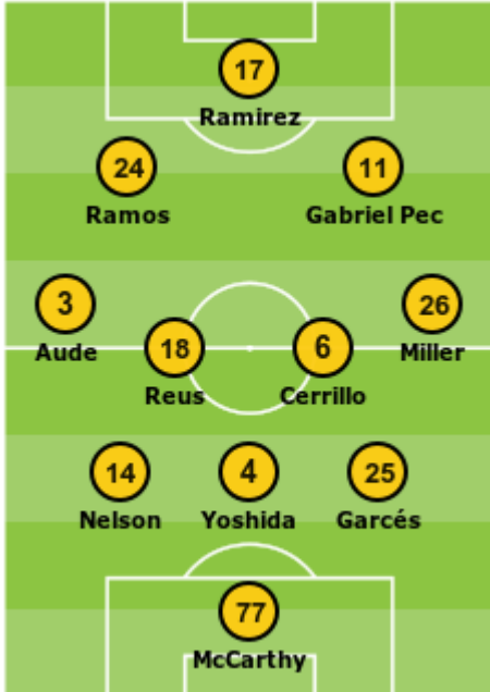
Herediano - LA Galaxy (3/6/2025 1-0)